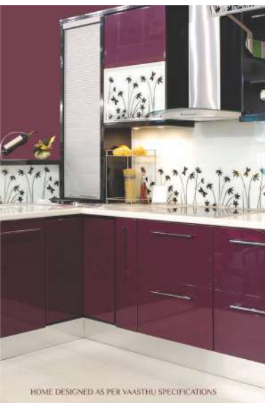
HOME DESIGNED AS PER VAASTHU SPECIFICATIONS